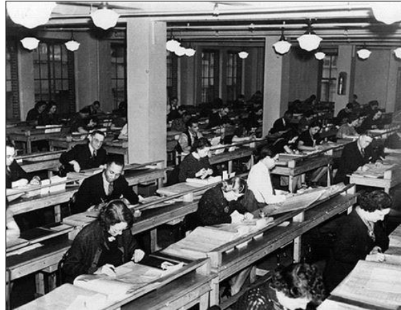
WPA workers indexing and preserving census records, New York City, October 1936.

Many sociologists today will likely hear resonances of what Michel Foucault criticizes as biopolitics , the technocratic care and control of populations through statistics and other social science knowledge.